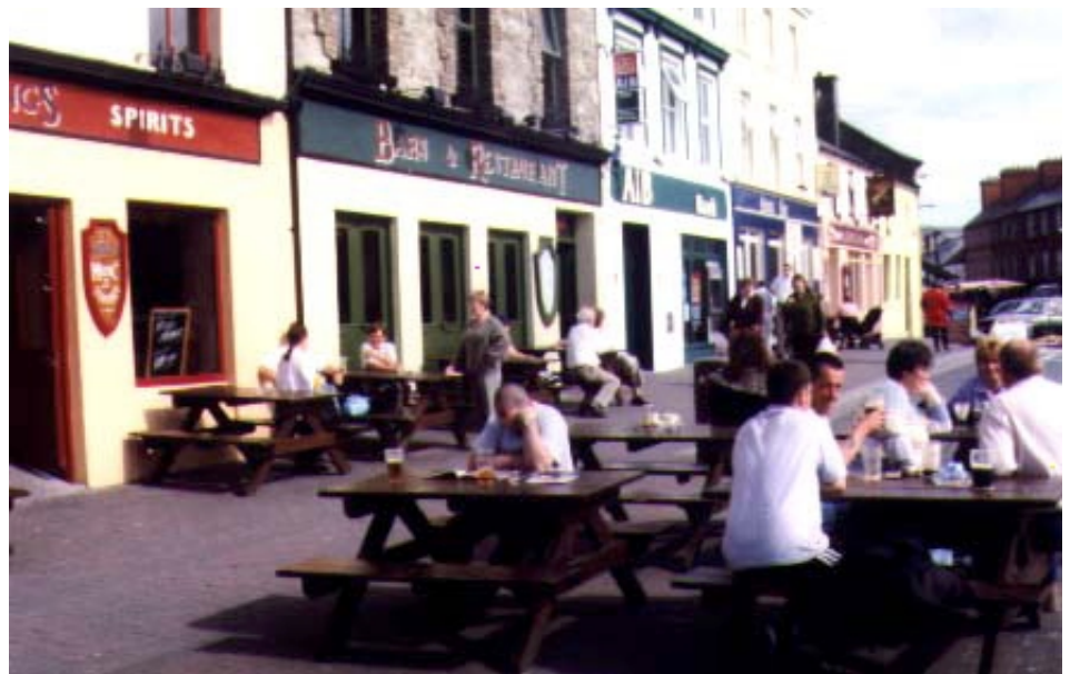
Enjoying a pint outside a pub in Clifden.